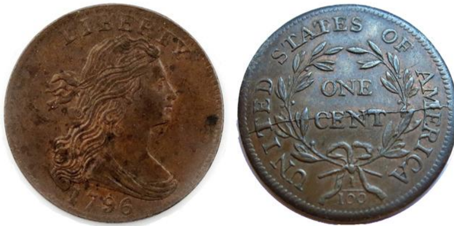
The 1796 Large cent that sold at the Wooley & Wallis sale

The firm put a 1796 cent on the block. It came unslabbed and unheralded. It was graded VF and carried an estimate of £500-£700. But some bidders were paying attention.