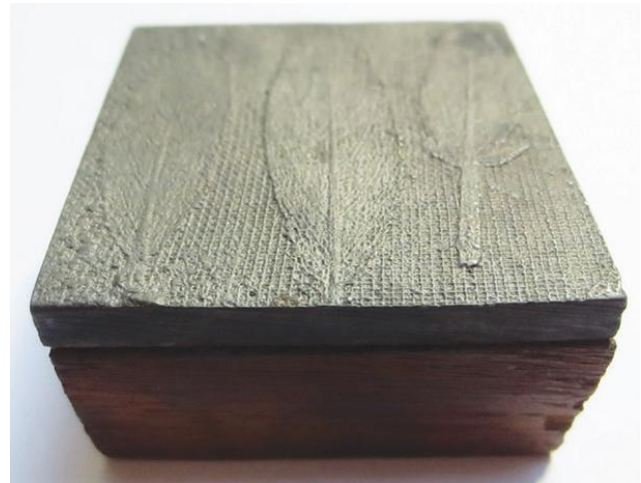
Leaf block believed to have been used to print money.

Experts, it says, believed that these images were made by pressing a leaf into plaster and making a mold of the impression that could then be used to cast printing blocks from type metal. However, until now, this was only guesswork, as none of the blocks were known to exist.